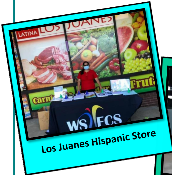
Los Juanes Hispanic Store