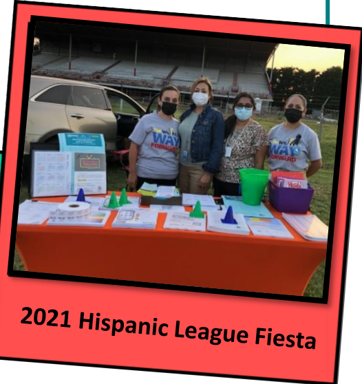
2021 Hispanic League Fiesta