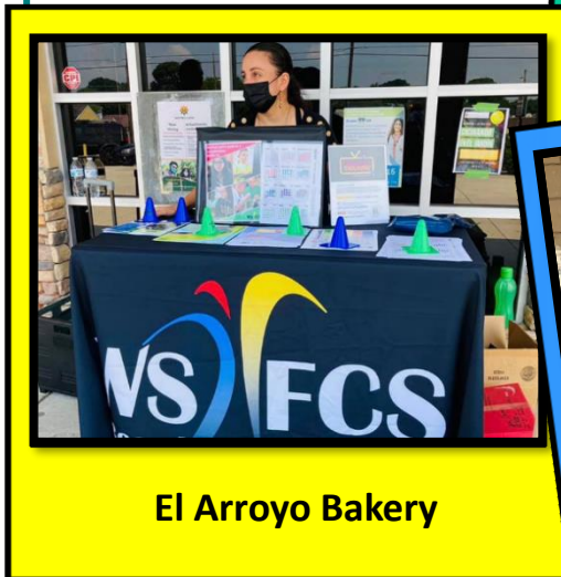
El Arroyo Bakery