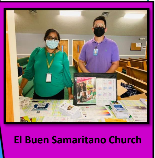
El Buen Samaritano Church

This summer and fall, the EL Parent Engagement Team has been providing resources to our Hispanic community, including student calendars, child nutrition information, parent-student handbooks, school flyers, and more. In July they handed out 1000 bags with information about school and community events, COVID-19 information, masks, hand sanitizers, and face shields. Stops included El Buen Samaritano Church, Peacehaven Mobile Homes, La Perlita, Tortilleria La Fe, the Hispanic League ID Drive, La Princesa Paeteria, El Arroyo Bakery, Compare Foods, and various elementary, middle, and high schools.