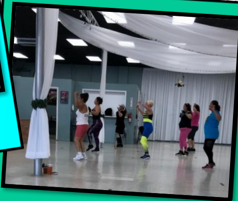
Zumba Latina Class